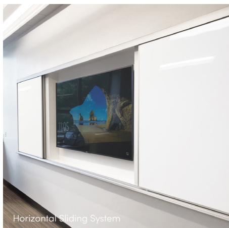
Horizontal Sliding System