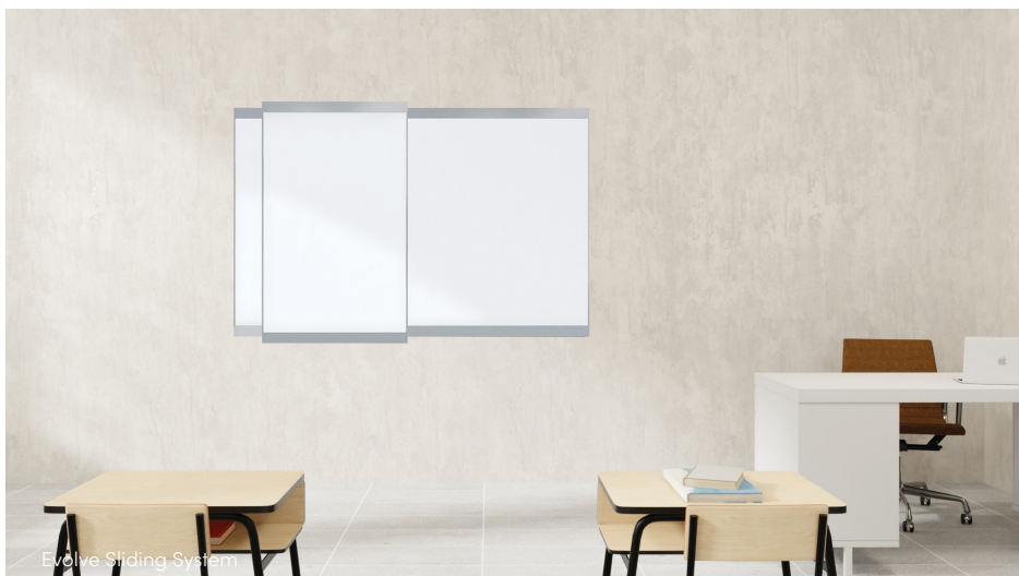
Involve Sliding System