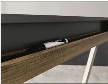
Metal accent strip and marker rail