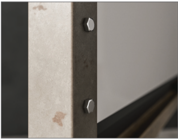
Exposed welds and hex bolts